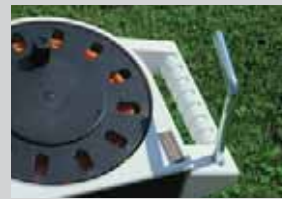
Mounted by means of earth spike