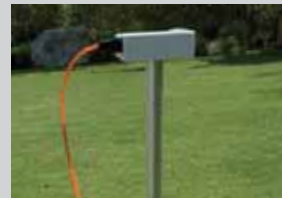
Sensing device and electronic housing