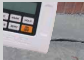
Protective rubber casing for electronic housing (ZipLevel Pro 35)